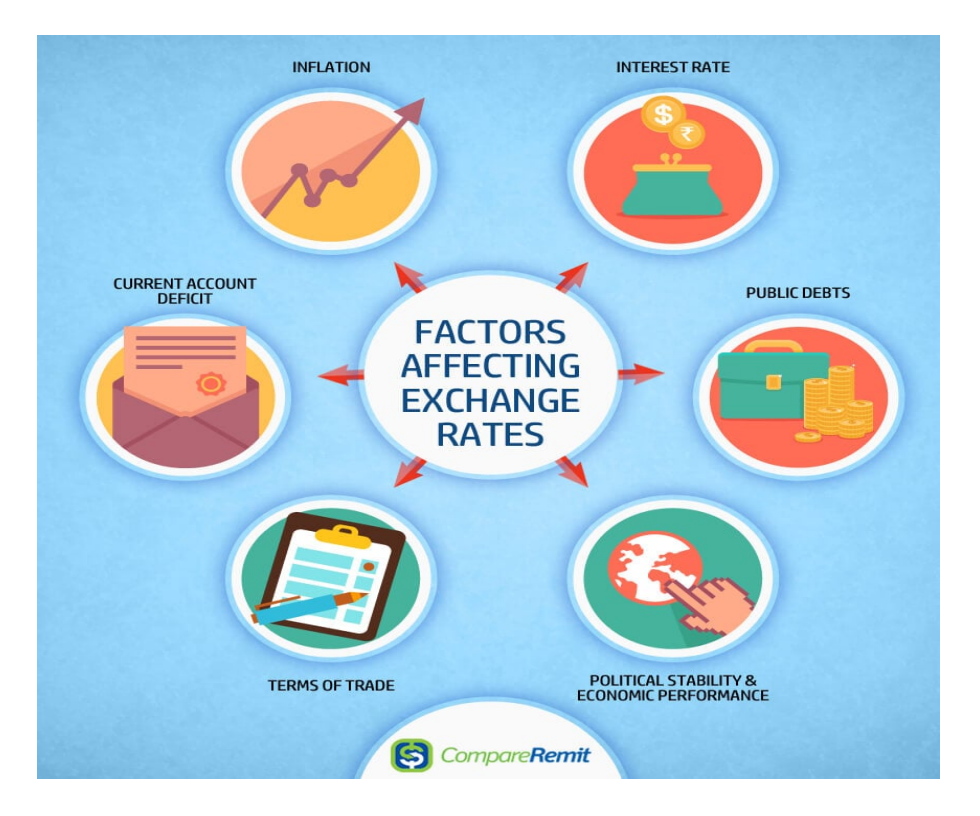
Fig. : 1

There are several factors that contribute to a currency's exchange rate. Here are some of the top factors that can affect an exchange rate: